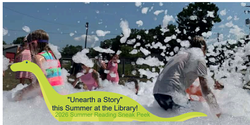
"Unearth a Story" this Summer at the Library! 2026 Summer Reading Sneak Peek

Reading programs, local authors, educational and musical events offered throughout the year.